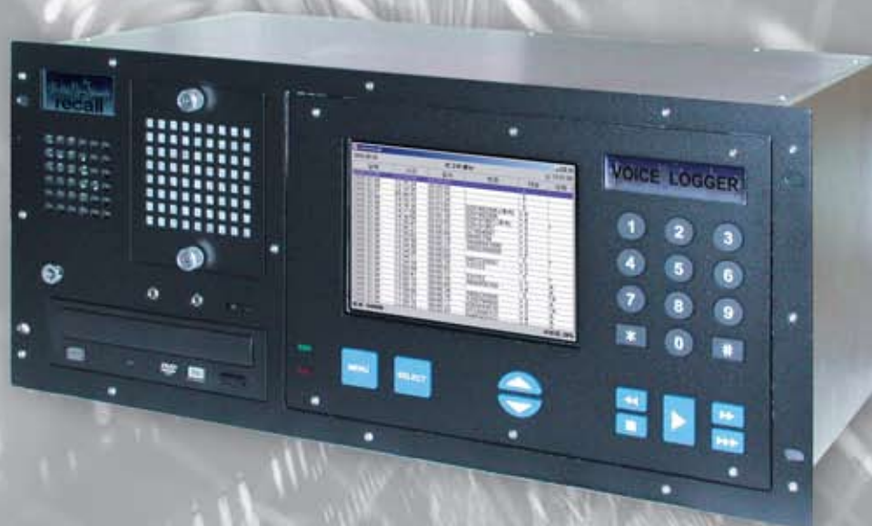
19" Rack Mount for Analog, ISDN, VoIP - Black