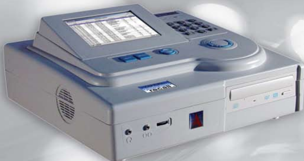
Analog Desktop Unit